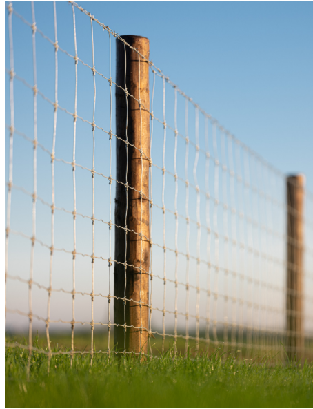
FENCES FOR OTHER LIVESTOCK