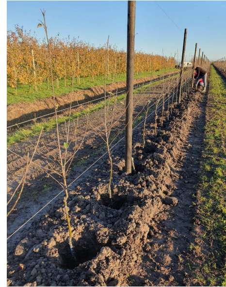
FRUIT TREE SUPPORT SYSTEM